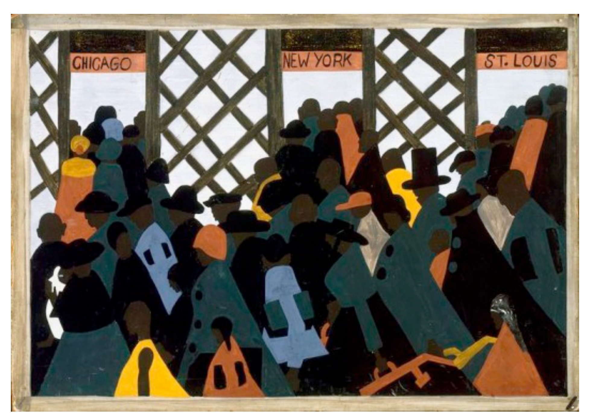
"The Migration of the Negro" (1), Jacob Lawrence, 1940