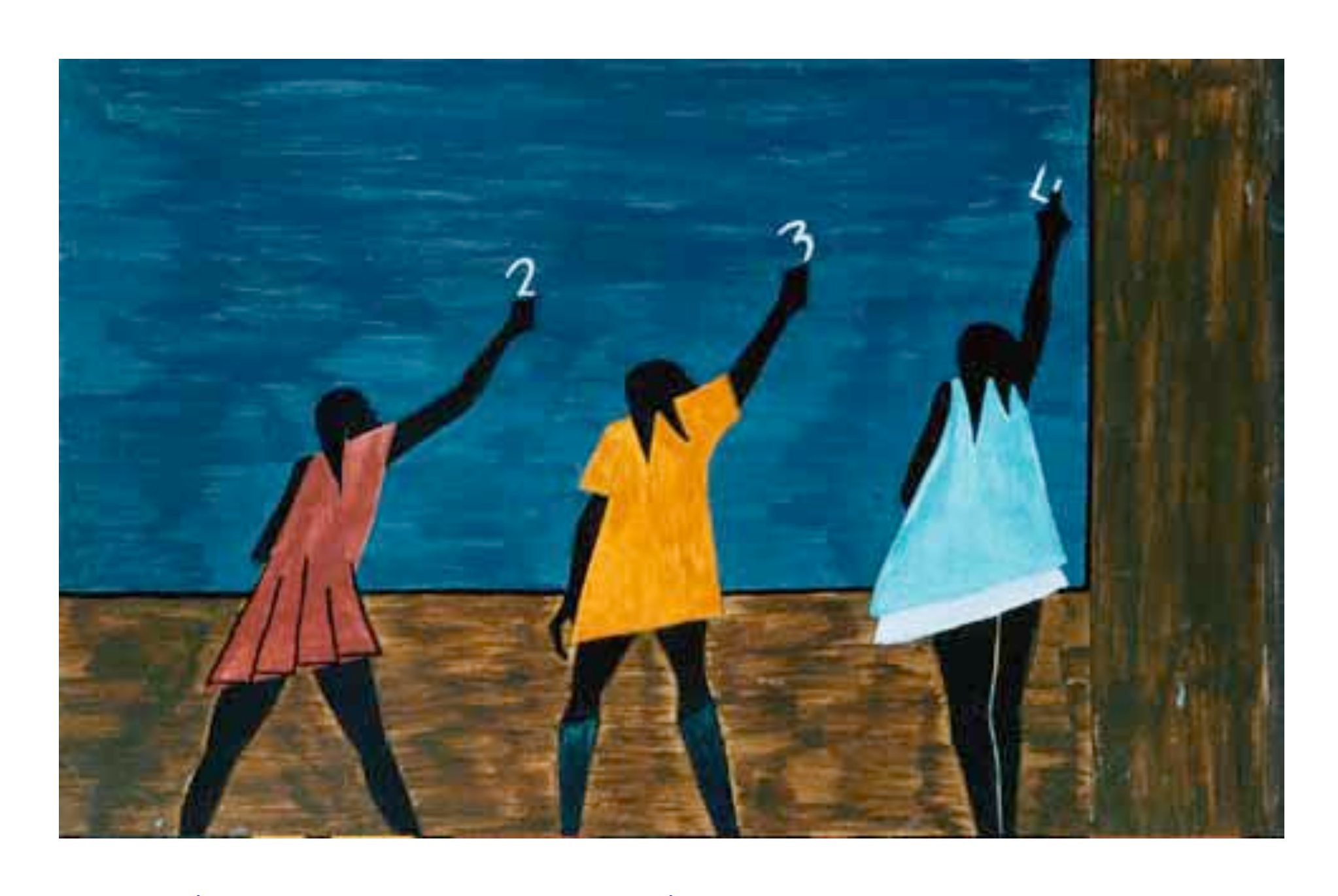
"The Migration of the Negro" (58), Jacob Lawrence, 1940