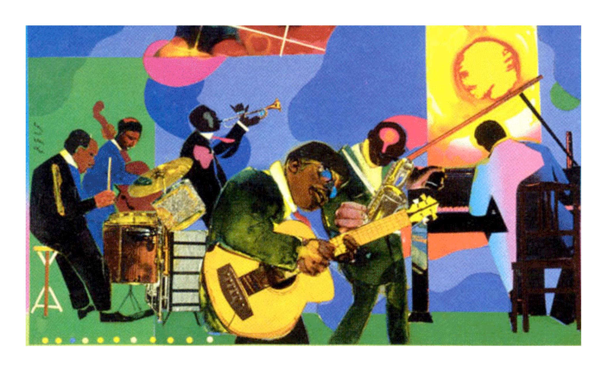
"Jammin' at the Savoy," Romare Bearden, 1980